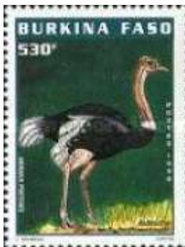
An ostrich, from a set of five stamps on protected species.