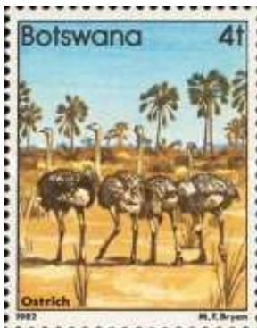
Ostriches, from a set of 18 definitive stamps featuring birds.