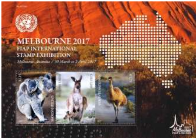
Melbourne 2017 Stamp Exhibition.