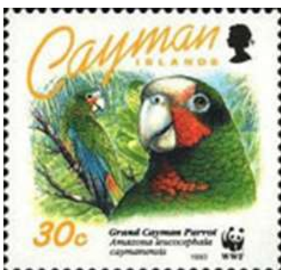
Grand Cayman Parrot (World Wildlife Fund). From a set of four stamps.