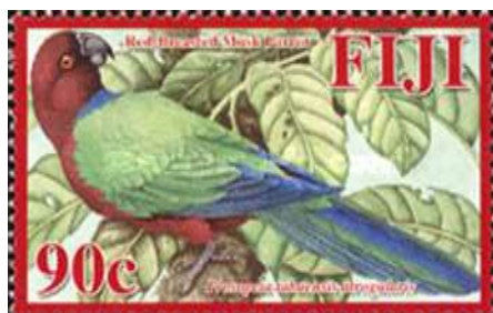
Fiji's parrots - Red-breasted Musk Parrot. One of a set of four.