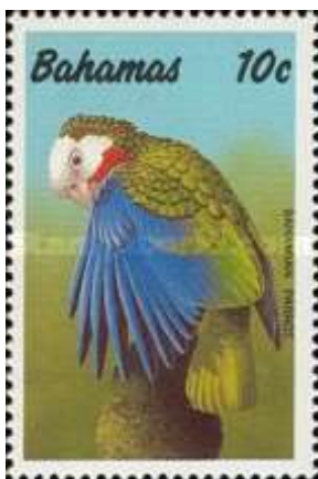
Cuban Amazon Parrot from a set of four stamps.