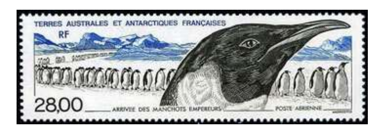
Image source: <a href="https://www.hipstamp.com">https://www.hipstamp.com</a>

This stamp, from the territory of the French Antarctic and Southern Lands, illustrates a column of Emperor Penguins marching across the ice, in perfect order.